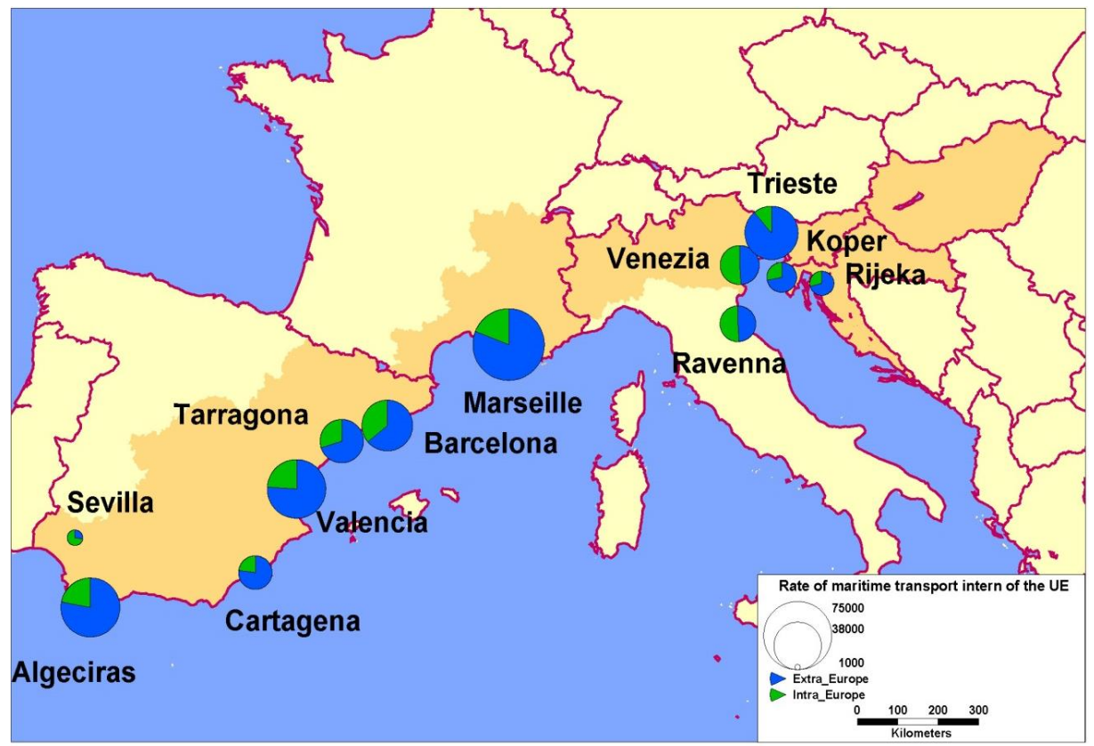
Volume of total goods handled by ports and rate of EU-internal flows (1000 tons / year)

As regards inland waterways , in 2010, freight traffic on the two waterways of the Corridor amounted to: