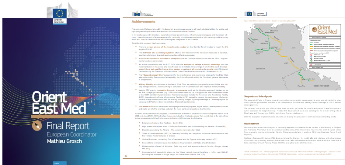
Figure 2 Excerpts from the Final Report III.