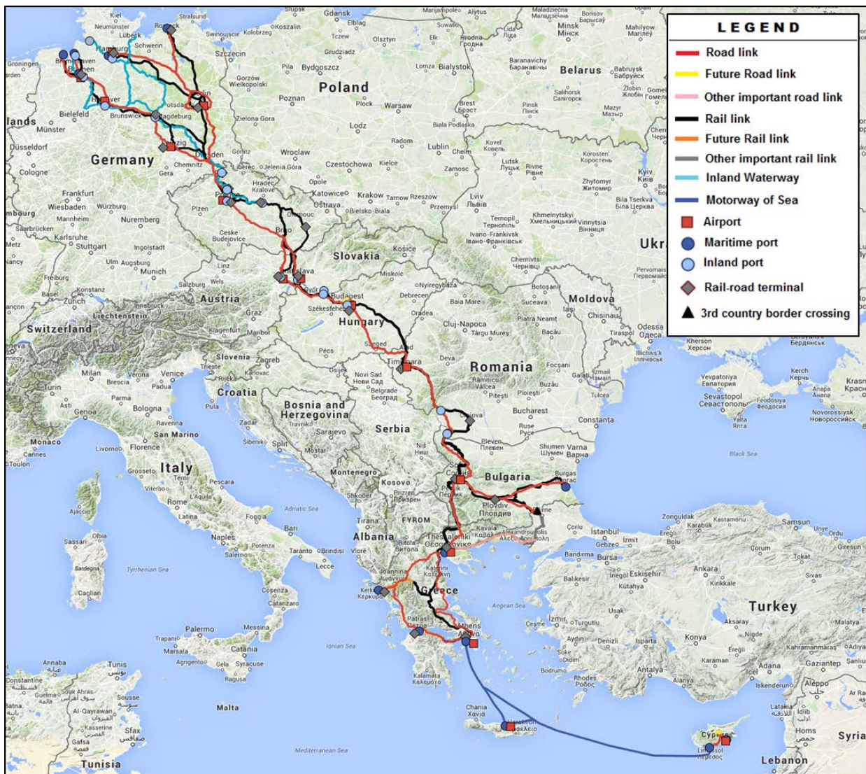
Figure 1: Alignment and nodes of the Orient/East Med corridor

The length of the corridor infrastructure sums up to approximately 5,800 km of rail, 5,400 km of road and 1,700 km of IWW. The number of core urban nodes along the Orient/East-Med corridor is 15, with the majority located in Germany (5) and Greece (3), as well as one per other Member State. The same number applies for core airports, from which 6 are dedicated airports to be connected with high-ranking rail and road connections until 2050. Furthermore, 10 Inland ports and 12 Maritime ports are assigned to the corridor, as well as 25 Road-Rail terminals.