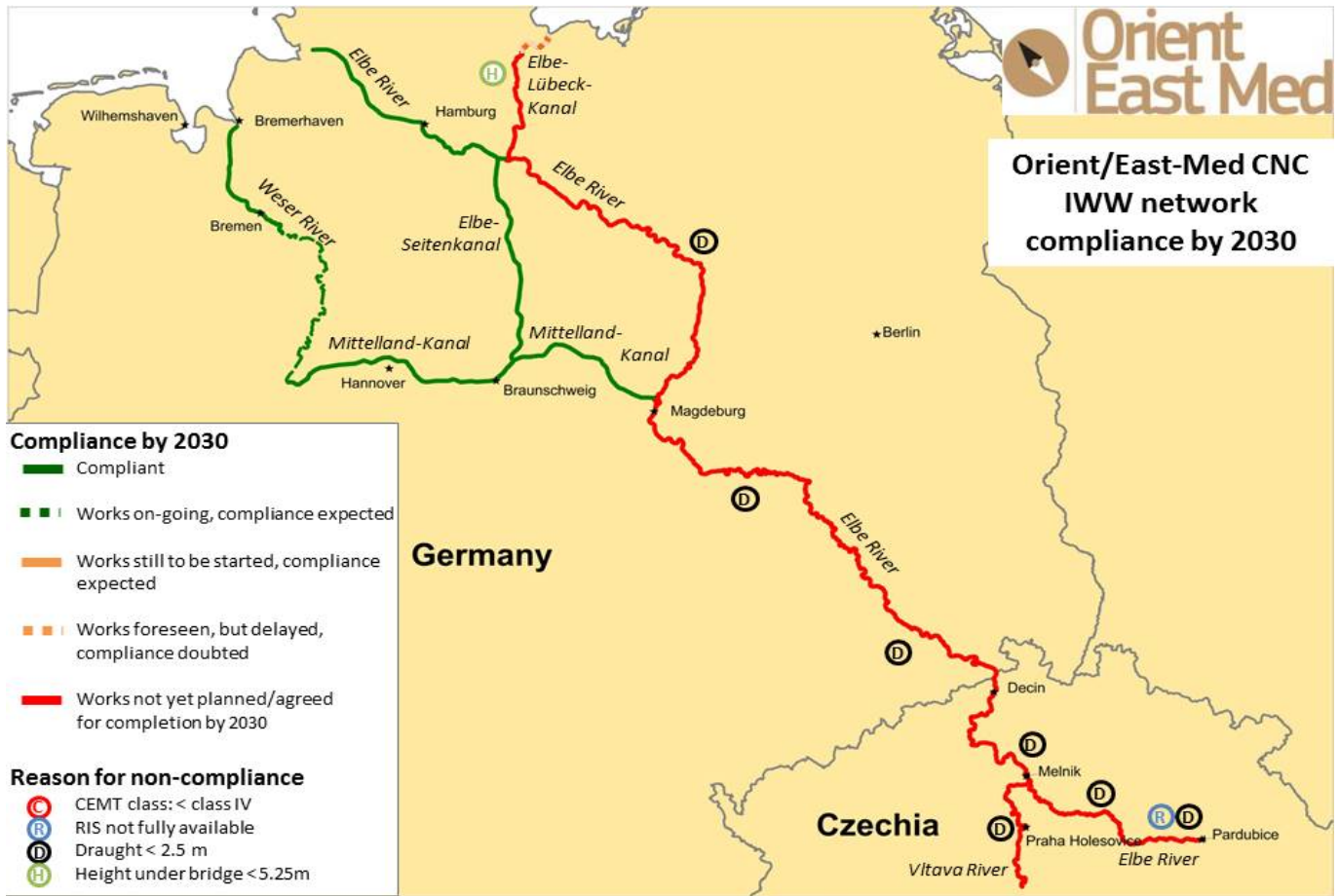
Figure 3: Forecasted compliance of the Corridor IWW network by 2030