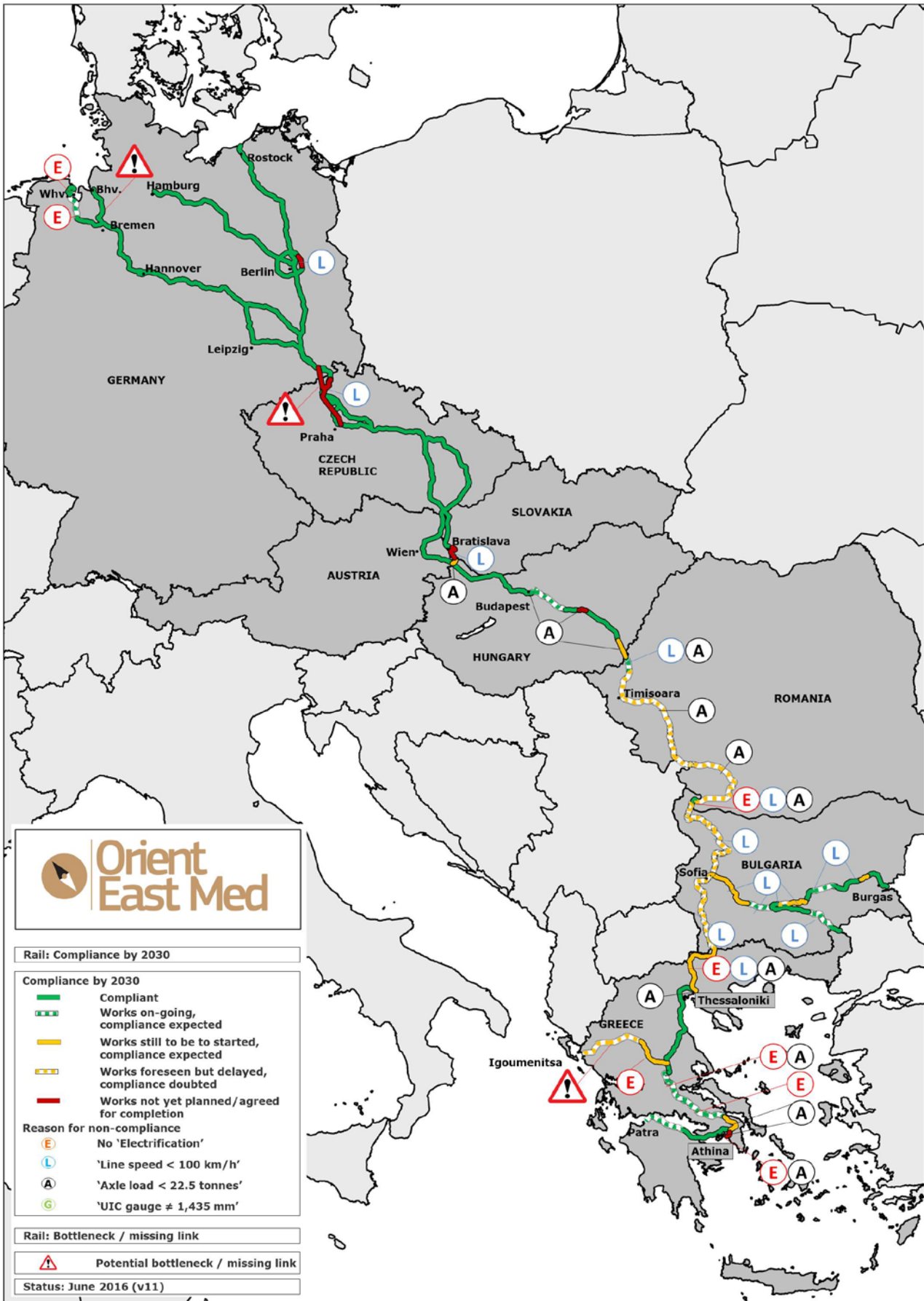
Figure 4: Forecasted compliance of Rail network by 2030 (electrification, load, speed)