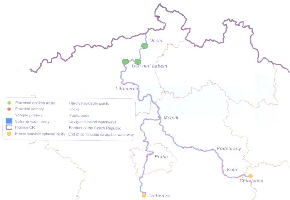
Figure 1 Czech inland waterways