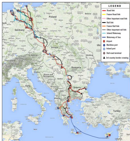
Figure 1: OEM Corridor Alignment

According to Regulation No. 1316/2013 and clarifications agreed with Member States, the Orient/ East-Med Corridor, as depicted below, consists of the following multi-modal parts: