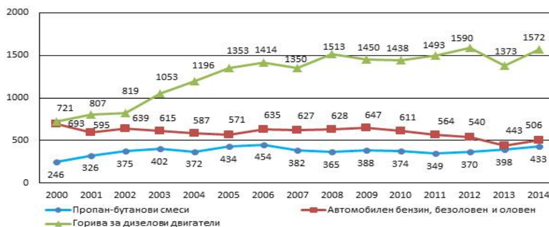
Fig.2. Consumption of fuels in road transport over the period 2000-2014, in thousands of tonnes of oil equivalent

[Key: Пропан-бутанови смеси = Propane-butane mixtures; Автомобилен бензин = Automotive petrol; Горива за дизелови двигатели = Fuels for diesel engines]