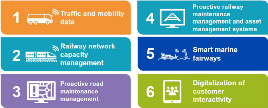
Figure 1. The six activities of the digitalisation programme.

The Finnish Transport Agency has started a three-year digitalization project (2016–2018), which paves the way for new transport services, modern road management and automated driving in Finland. The estimated cost of the project is EUR 35 million. The digitalization project has six activities and approximately 70 projects. Some of these projects are presented in this report.