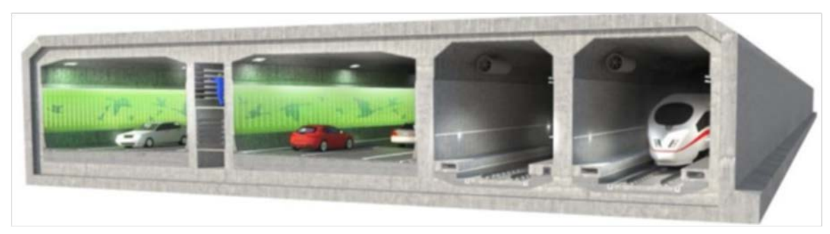
Figure 2: Cross section of Fehmarn Belt Fixed Link tunnel

The Fehmarn Belt Fixed Link will establish a direct link between Denmark and Germany via an 18 km long rail/road tunnel. The project, which will be completed in 2021, will create more rail and road capacity between the two countries. Furthermore, in combination with upgrading projects on the Danish and German railway hinterland connections, the project will reduce travel times from 4.5 to around 2.5 hours for rail passengers between Copenhagen and Hamburg. Travel times for freight trains will also be significantly reduced.