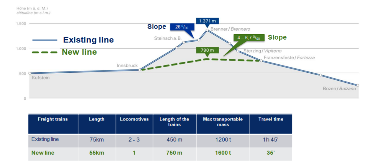
Figure 3: Longitudial section and basic train parameters of Brenner

The Brenner Base Tunnel is the main element of the new Brenner railway from Munich to Verona. This rail tunnel runs from Innsbruck in Austria to Fortezza in Italy over a length of 55 km. If one adds the Innsbruck railway bypass the entire tunnel system is 64 km long. Therefore, when it becomes operational in 2026, the Brenner Base Tunnel can be considered the world's longest underground railway connection. The new tunnel will increase the capacity up to 400 trains per day, reduce travel time between Munich and Verona from 5.5 to 3 hours and will improve the efficiency of rail freight operation by allowing longer and heavier trains due to a significant reduction of the climbing slope.