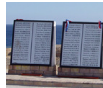
Sharm el-Sheikh accident memorial (January 2004)