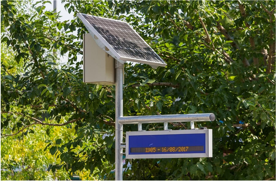
Three row displays – 155 pcs.